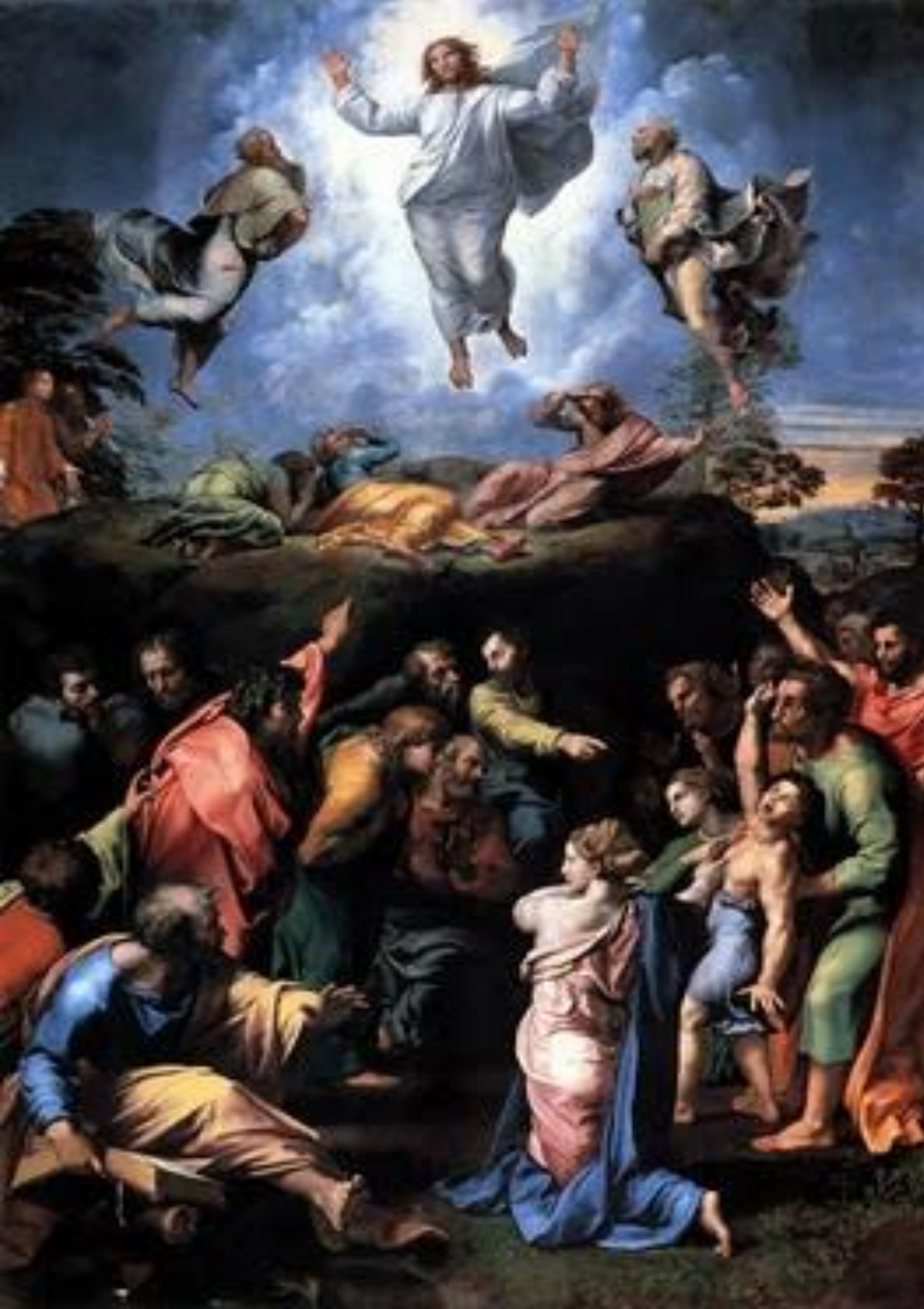
Raphael's The Transfiguration of Jesus Christ