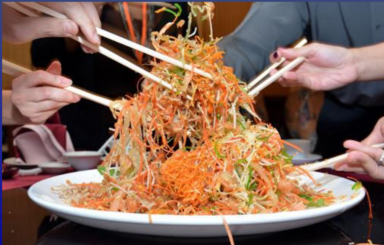
Yee Sang Lo Hei