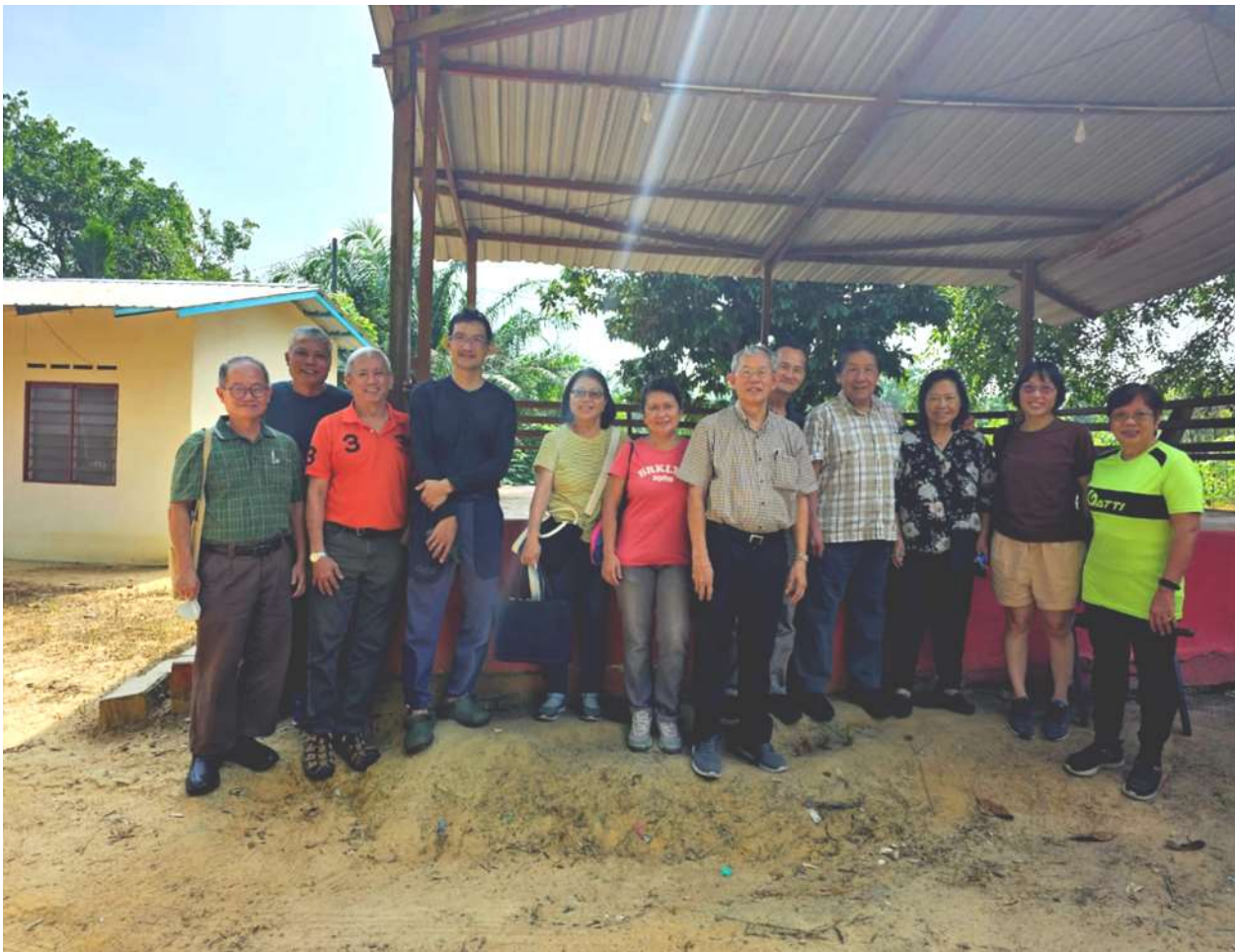
Team of 12 from HLCE for the Medical & Children's Ministry at Kpg Jemeri on 27/7/24