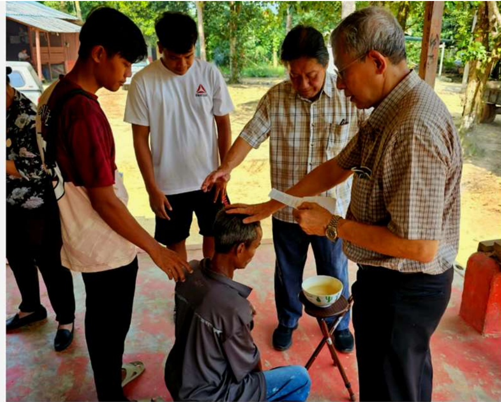
Baptism of a believer at Kpg Jemeri on 27/7/24