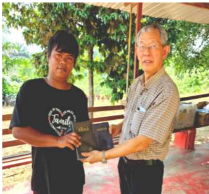
Handing over 18 copies of Alkitab to Ps Alak for the believers on 27/7/24