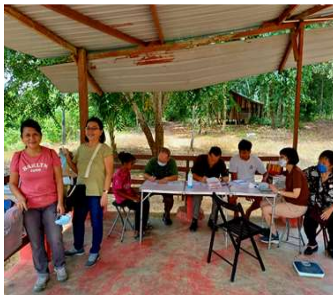
Medical service at Kpg Jemeri, 27/7/24