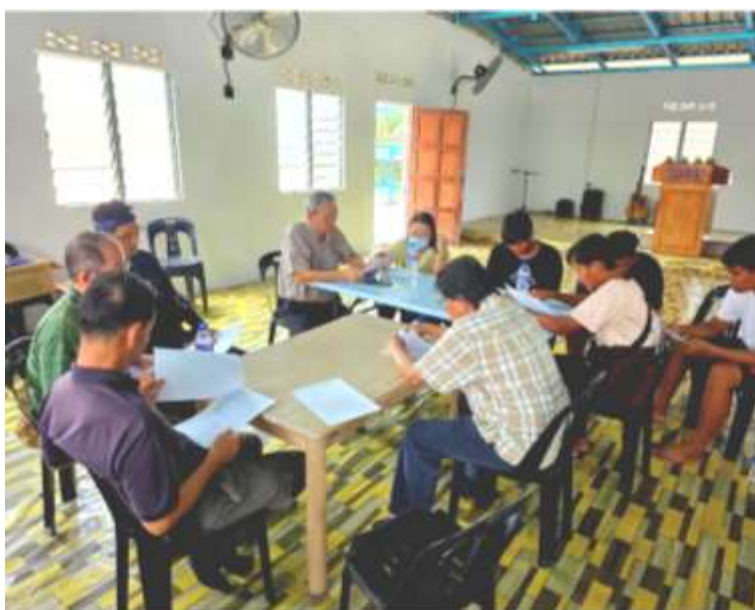
Meeting with the pastoral staff of the OA Ministry in Rompin area, 27/7/24