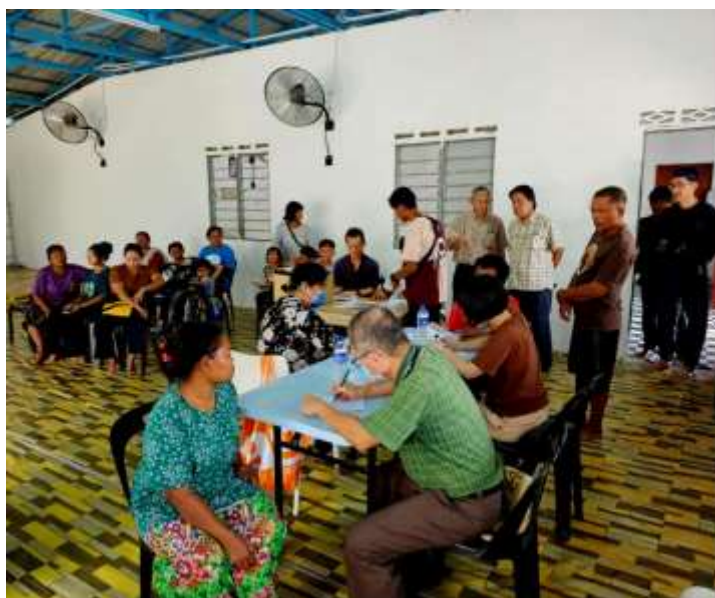
Medical service at Kpg Sg Gayung on 27/7/24