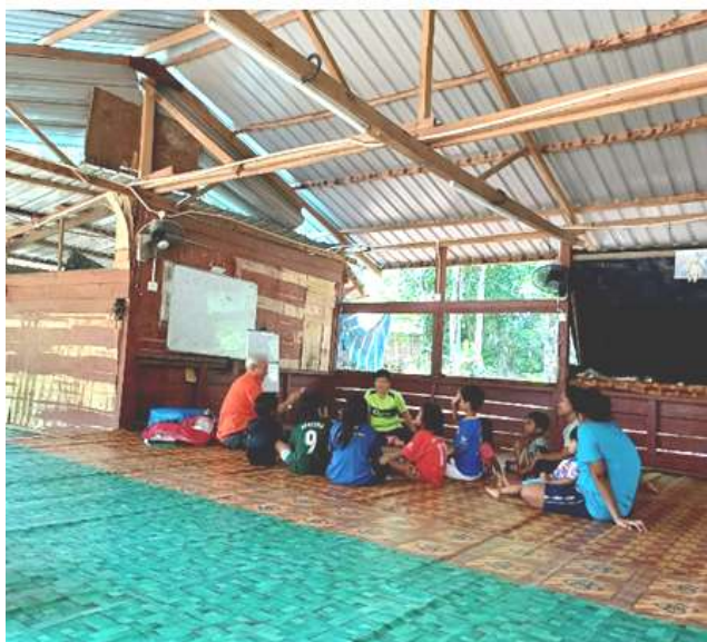
Conducting Sunday School to the children at Kpg Jemeri, 27/7/24