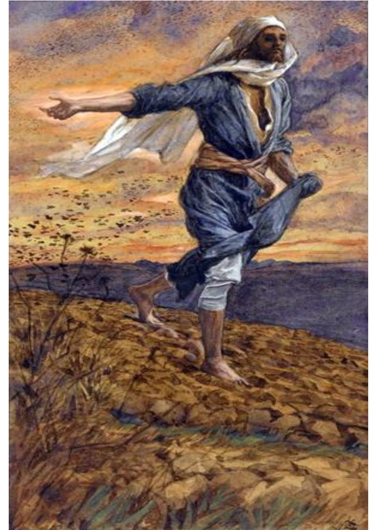
The Parable of the Sower by James Tissot

Submission to the Lordship of Christ is conditional